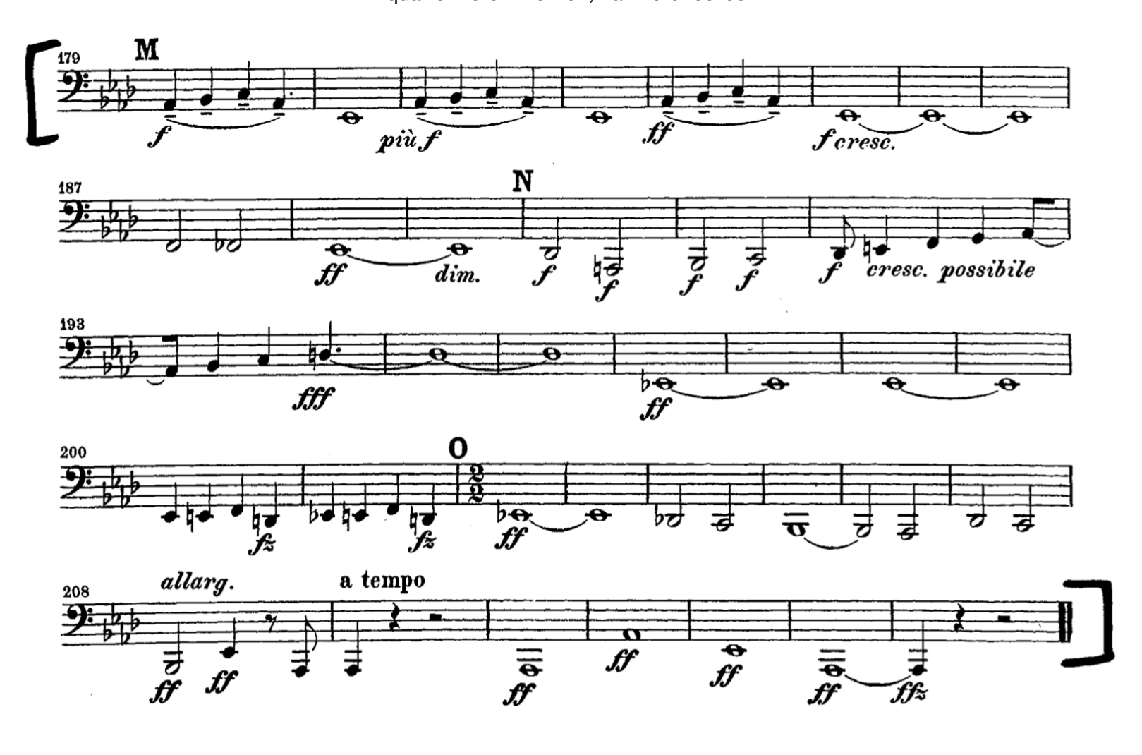
Excerpt C Holst- "Jupiter" from The Planets 2/4 time signature, quarter note=126