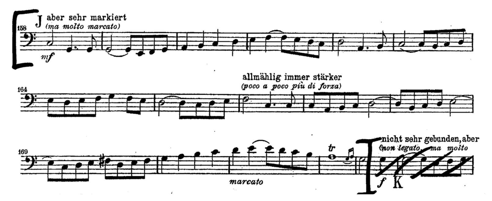
Excerpt D Brahms- Symphony No. 4, Mvt. III 2/4 time signature. Quarter note=112