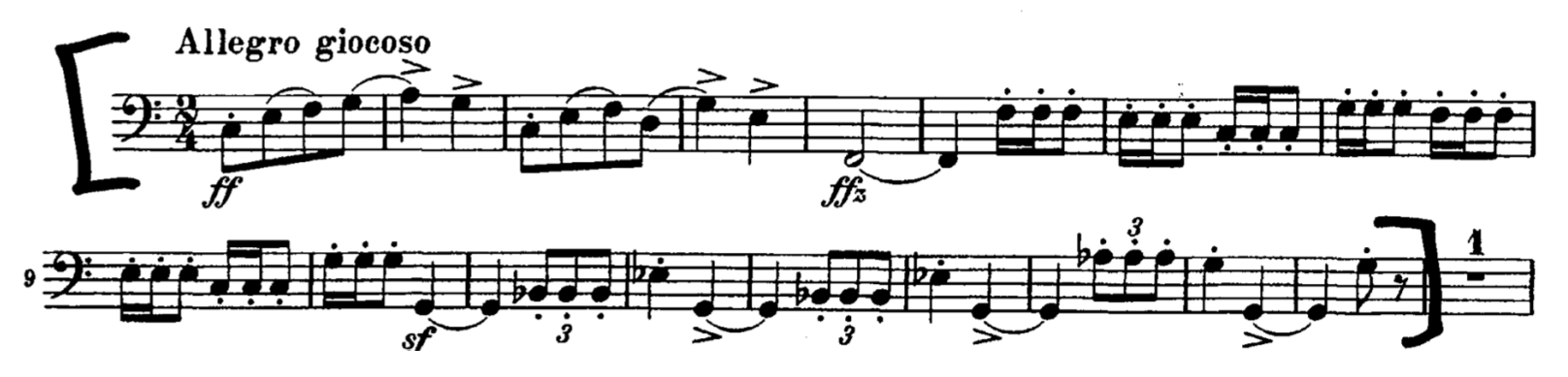
Excerpt E Beethoven- Symphony No. 5 3/4 time signature. Dotted Half Note=86