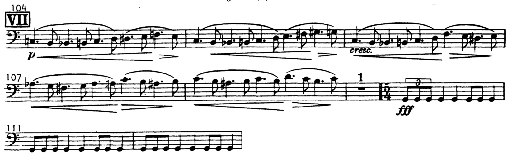
Excerpt E Smetana- Overture to The Bartered Bride 2/2 Time Signature, half note=132

Excerpt D Holst- "Mars" from The Planets 5/2 Time Signature, quarter note=80