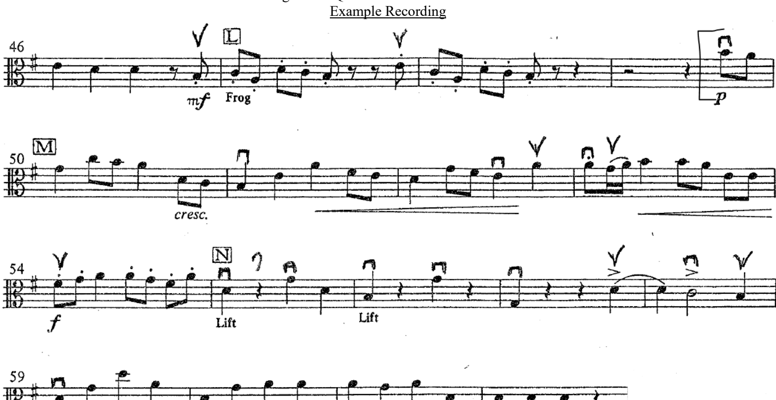
Excerpt C Verdi- Overture to Forza del destino

Handel Concerto Grosso Op. 6 No. 1 Arr. Dackow 4/4 Time Signature. Quarter Note=112. Start at the Bracket.